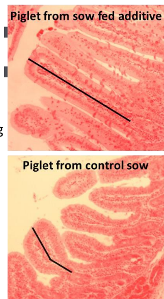
Fig. 1 Duodenal histology

In vitro tests and interrogation of whole genome sequence data, conducted in line with European Food Safety Authority (EFSA) guidance, revealed no safety concerns. In addition, the microbial strain has been successfully spray dried and a feed additive product has been developed. Following spray drying, the strain tolerates temperatures as high as those experienced during feed pelleting. Stability studies also demonstrate good survival during powder storage at both 4 °C and room temperature, and at room temperature in a sow vitamin and mineral pre-mixture.